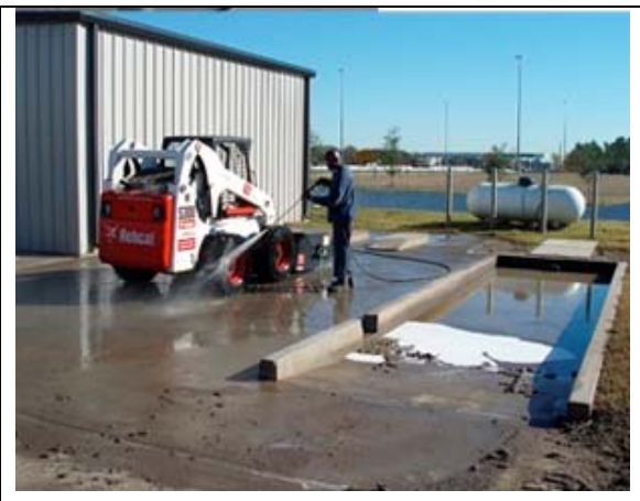
Clean trucks and equipment in the designated location.

➤ If solvents or degreasing wastes are spilled, contain the spill and clean up using a spill kit. Contact UK Environmental Management for guidance for proper disposal.